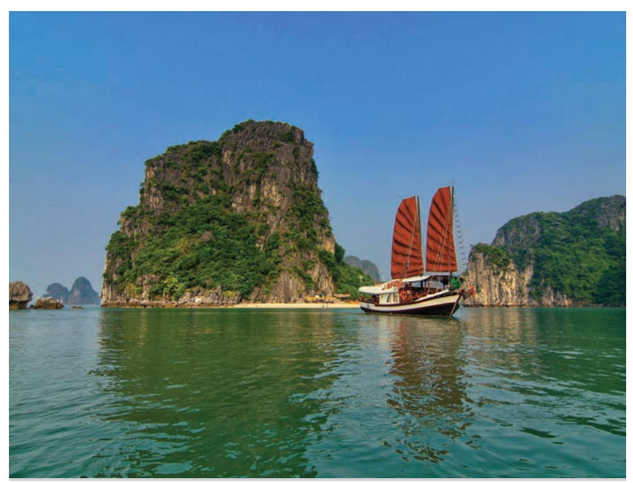
L'Amour Junk, Ha Long Bay

Your destination is Sapa, perched on the mountainside opposite Mt. Fan Si Pan, Vietnam's highest peak. Sapa is in a scenic valley, surrounded by the mountains and with hillside rice terraces. The ethnic communities live in numerous villages, tucked away on the lower slopes of the valleys, and many villagers wear authentic traditional costumes. The